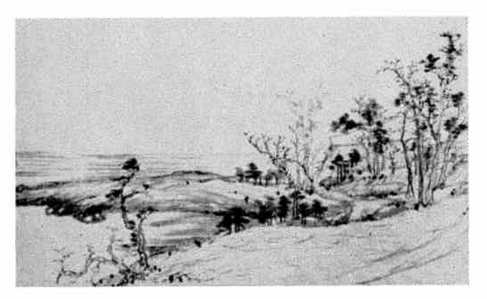
Top: Copy after Huang Kung-wang, detail of Dwelling in the Fu-ch'un Mountains. Palace Museum Collection, Taiwan.

Bottom: Huang Kung-wang (1269-1354), Dwelling in the Fu-ch'un Mountains. Palace Museum Collection, Taiwan.