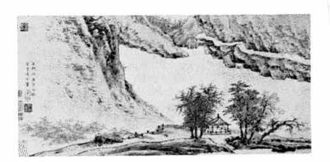
Ch'iu Ying (c. 1510-51), detail from Landscape after Li T'ang. Seals of Hsiang Yuan-pien and others. Collection Freer Gallery of Art, Washington, D.C.